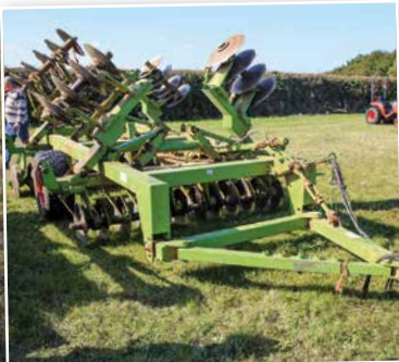
£3,400 was paid for this set of Dowdeswell 84-series folding discs. These carried a local Haynes dealer sticker and appeared to be in good order with plenty of wear left in the discs.