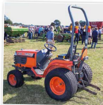
Kubota compact tractors are always in demand and this B2100 4wd hydrostatic with 3,090 recorded hours was described as in good working order and made £3,900.