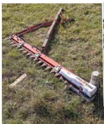
An elderly Matrot electric drive side-knife achieved £20.