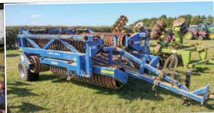
In very good condition, these Dal-Bo Compact 1230, 12.3m folding rolls attracted competitive bidding and are likely to see considerable use this autumn if the dry weather continues. They were straight from Lower Dean's Farm and their new owner paid £9,000.