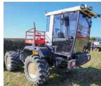
One of the more unusual items for sale was this forward control Mercedes Unimog. It was originally a Landquip sprayer conversion and was new in 1978 with 51,000km recorded. The tyres were Michelin XM108 540/65R24 with 80 per cent remaining tread and the winning bid was £4,300.

A mid-September dispersal sale of farm machinery and equipment attracted buyers from across the South-East and further afield, generating some excellent prices. David Williams was there.