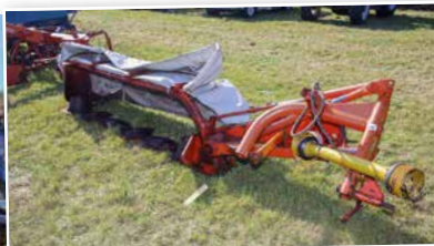
In good condition for its age, this Kuhn 135 5F reversible plough was manufactured in 1990. It achieved a good price of £680.