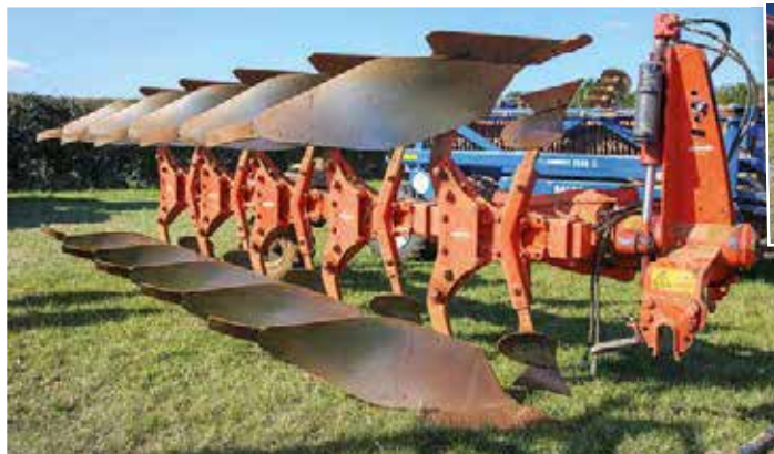
Sold at an ideal time for use this autumn, the Kuhn 135 5F reversible plough was from Lower Dean's Farm and made £7,500. It was in excellent order with almost new wearing metal throughout.