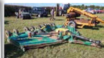
A large Spearhead 4.5m 450-9S hydraulic-folding mower appeared to be in working order although the PTO shaft needed attention. It sold for £2,400.