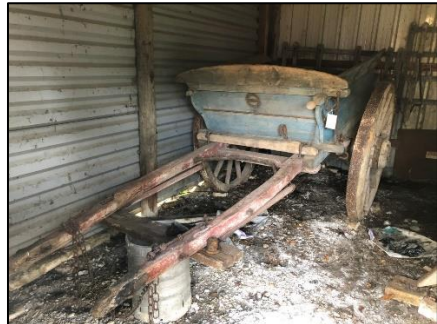
Selection of Lots