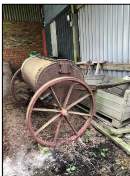
Water bowser – believed to be a fire engine