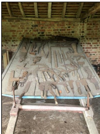
Assorted bagging hooks, hand bills etc