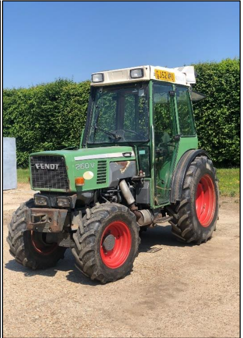
Lots 311 and 312