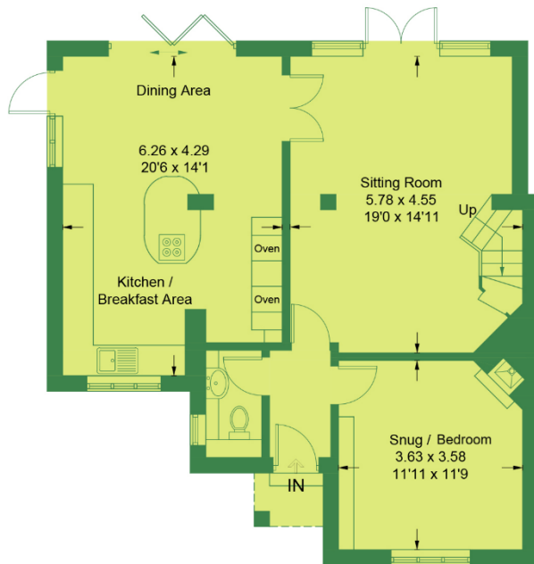
Ground Floor - 72.9 sq m / 785 sq ft